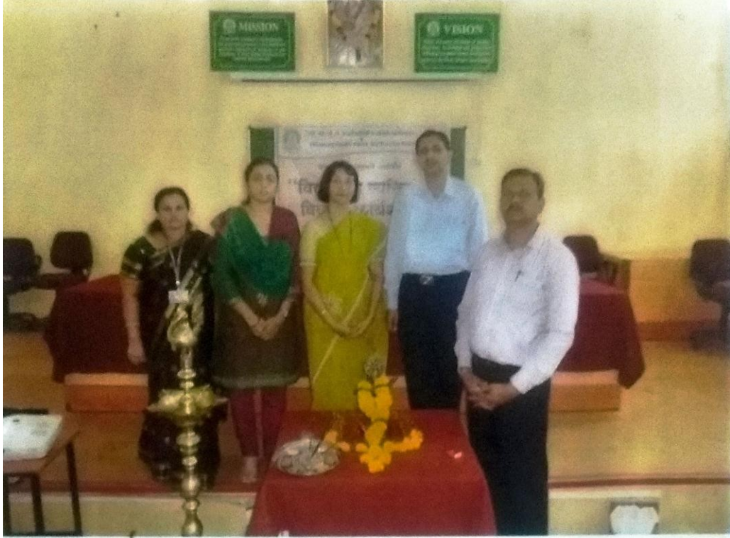
Lamp Lightening and Inaugural function of workshop