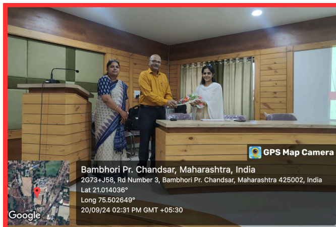
Bambhori Pr. Chandsar, Maharashtra, India 2G73+J58, Rd Number 3, Bambhori Pr. Chandsar, Maharashtra 425002, India Lat 21.014036° Long 75.502649° 20/09/24 02:31 PM GMT +05:30