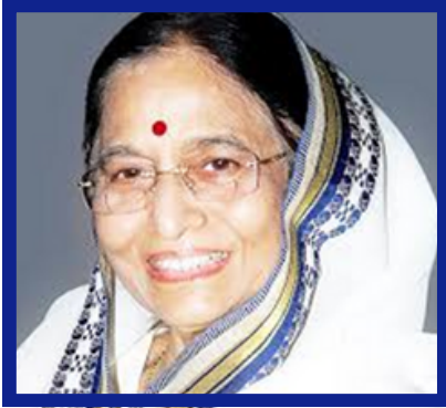
Hon. Sou. Pratibhatai Patil Former President of India