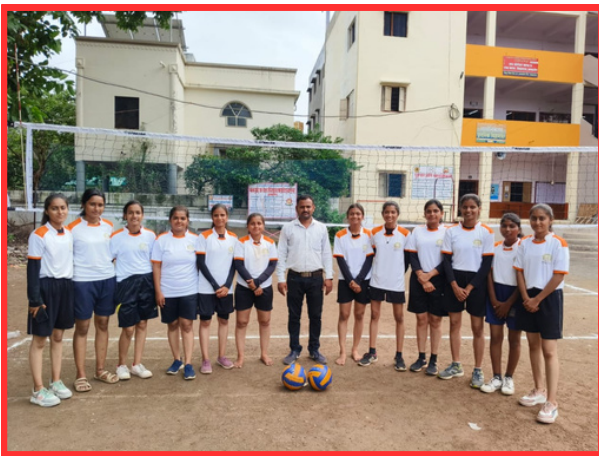
GIRLS HOLLYBALL Intercoallge Volley ball @PCA Amalner