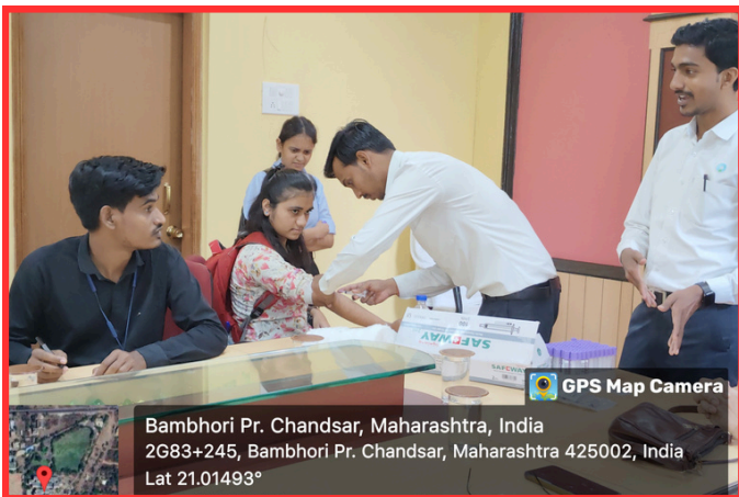
Bambhori Pr. Chandsar, Maharashtra, India 2G83+245, Bambhori Pr. Chandsar, Maharashtra 425002, India Lat 21.01493°