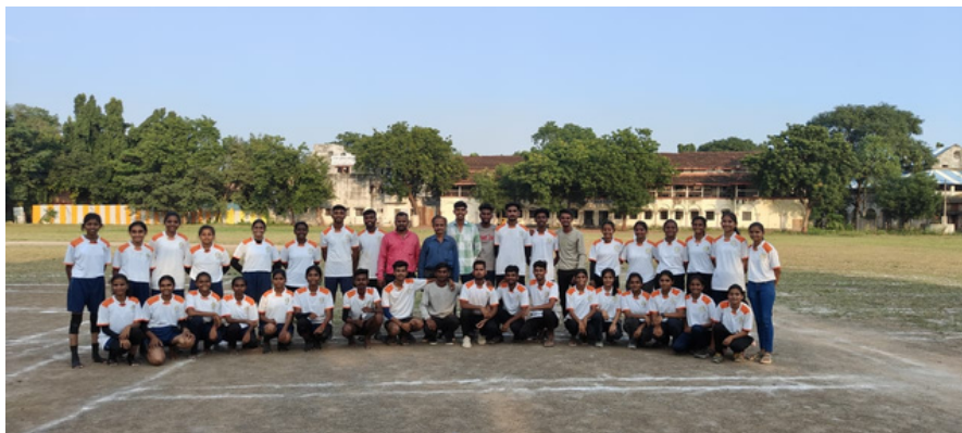
KHO KHO BOYS-Intercollege PCA Amalner