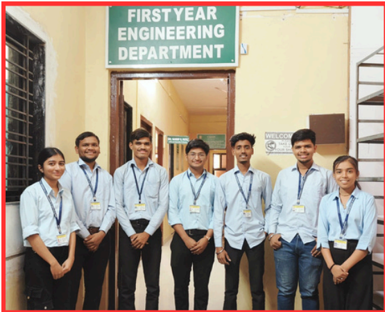
AVISHKAR- UNIVERSITY LEVEL