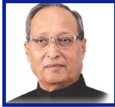
Dr. Devisingh R. Shekhawat Former Chairman, Governing Body