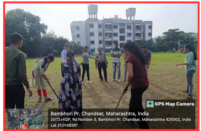
Bambhori Pr. Chandsar, Maharashtra, India 2G72+XQP, Rd Number 3, Bambhori Pr. Chandsar, Maharashtra 425002, India Lat 21.014856°