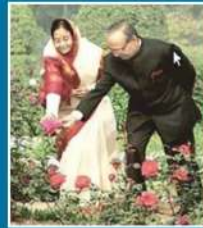
Hon'ble Smt. Pratibhatraji Patil & Hon'ble Dr. Devisinghji Shekhawat