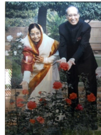
Hon.Smt. Pratibhatai Patil & Hon. Dr.Devisinghji Shekhawat