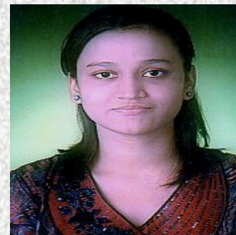
Third Topper (75.60 %)