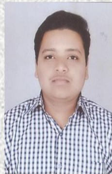
Second Topper (CGPA-8.22 )