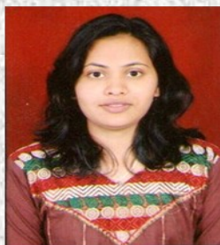
First Topper (73.60 %)