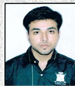
Third Topper (69.4 %)