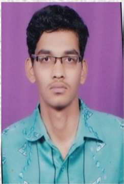
First Topper (CGPA -8.78)