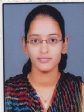
Second Topper (CGPA-8.43)