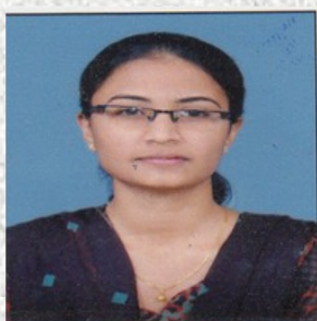
First Topper (79.80%)