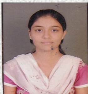
Second Topper (75.89 %)