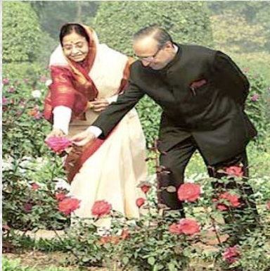
Hon'ble Smt. Pratibhatai Patil & Hon'ble Dr. Devisinghji Shekhawat