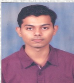
Second Topper (70.33 %)