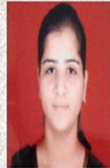
Third Topper (CGPA-8.08 )