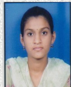
Third Topper (CGPA-8.35)