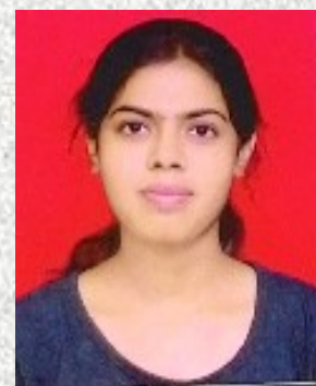
Third Topper (CGPA-8.7)