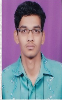
Second Topper (CGPA-8.57 )