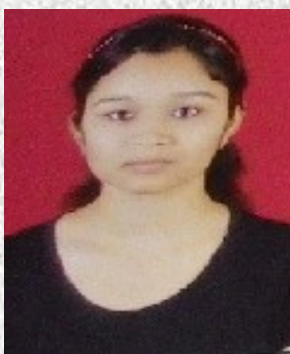
Second Topper (CGPA -8.74)