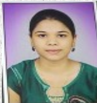
First Topper (CGPA-8.91)