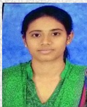
Second Topper (CGPA-8.74)