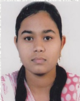
First Topper (CGPA -8.91)