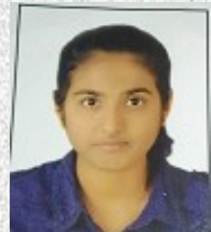
Second Topper (CGPA-8.74)