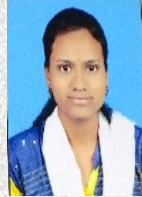
Third Topper (CGPA-8.43 )