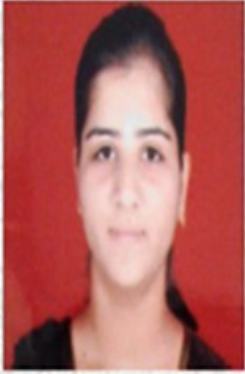
First Topper (CGPA -8.78)