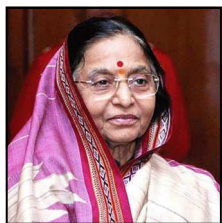
Mrs. Pratibha D. Patil Former President, India