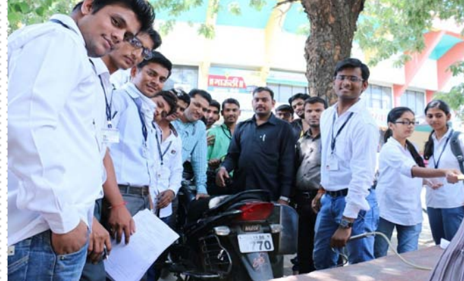
CSR Activity Conducted on 26/09/2015 Near Stadium Complex Jalgaon Free PUC Checking Camp under MBASA