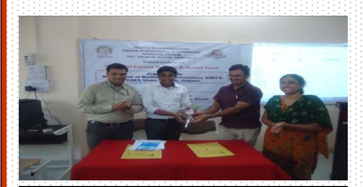
For the MBA Student Department Organized Expert Lecture under MBASA on 29/09/2015