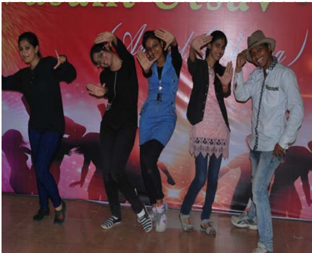
Miss- Match Day