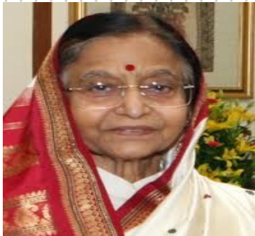
Hon. Sau. Pratibhatai D. Patil Former President of India & Founder of the College