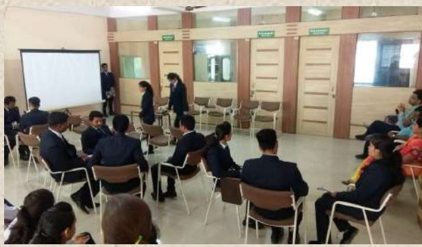
Role Play event organized on 28/07/2018. It helps in understanding how to handle a particular situation & better decision making with communication skill and leadership quality.