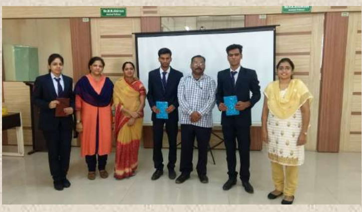
Quiz Competition on 11/08/2018 conducted to enables students to think from different angles, giving them an opportunity to sharpen their teamwork skills.