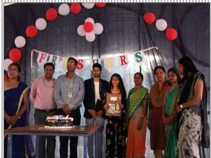
Fresher's Party for MBA First year organized by MBA-II year students to help new students feel comfortable in the new environment, inculcate in them the ethos and culture of the institution on 12/10/2019