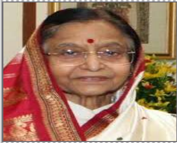
Hon. Sau. Pratibhatai D. Patil Former President of India & Founder of the College