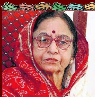
Hon. Sau. Pratibhatai D. Patil Former President of India & Founder of the College