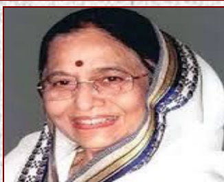
Hon. Smt. Pratibhatai Patil Former President of India & Founder of the College

To provide conducive environment for preparing competent, value added and patriotic engineers of integrity of par excellence to meet global standards for societal Development.