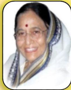
Smt. PRATIBHA DEVISINGH PATIL Former President of India Founder Chairperson Shram Sadhana Bombay Trust