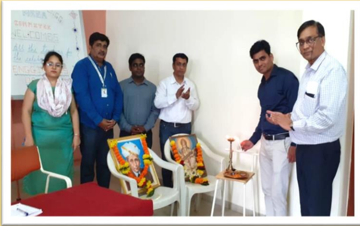
Engineering Day Celebration