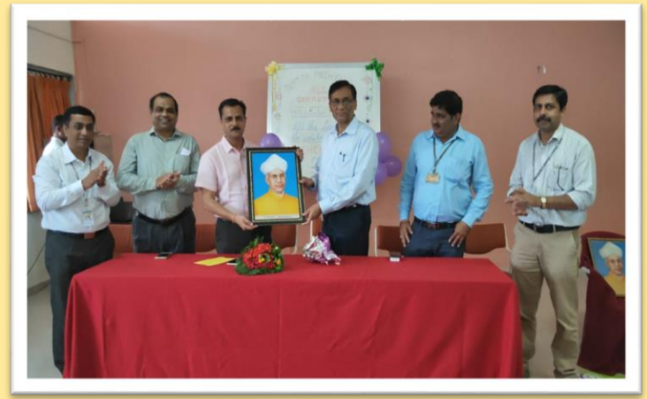
Teachers Day Celebration