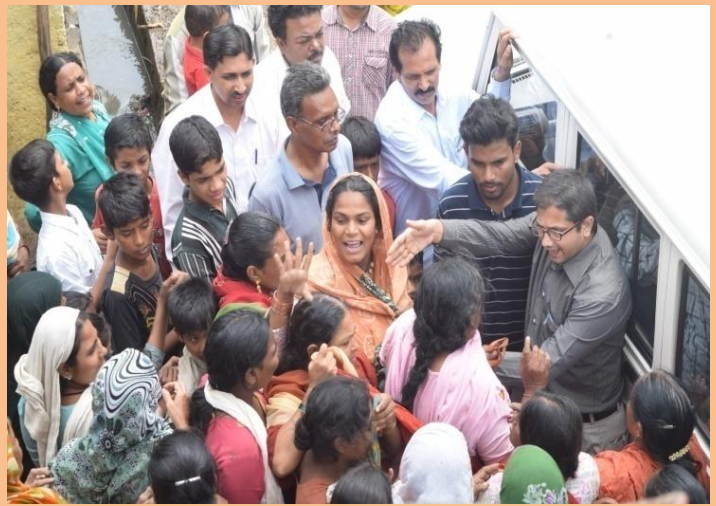
A Helping Hand for People in Flood Affected Area