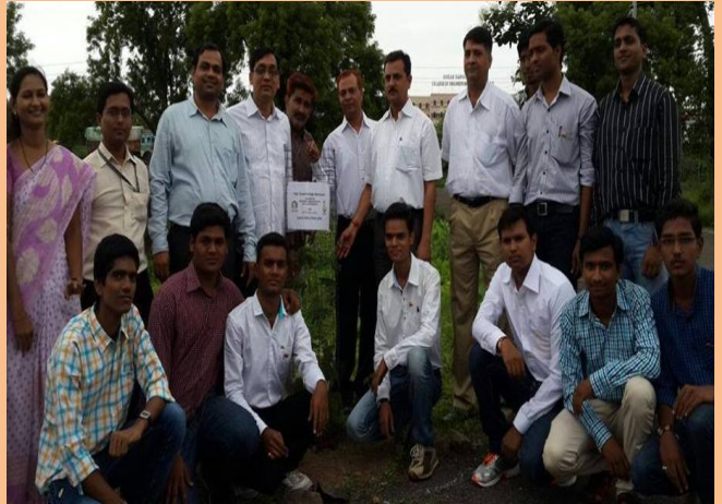
Tree Plantation on Independence Day 2014