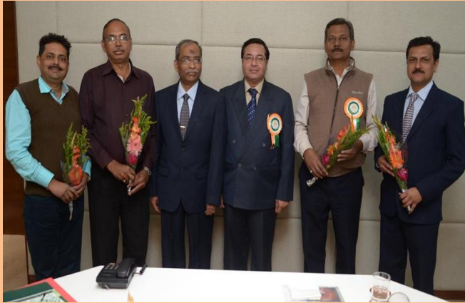
Felicitation of Faculties for completing Ph.D