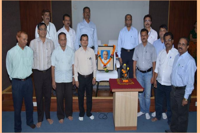
Rashtriya Ekata Diwas