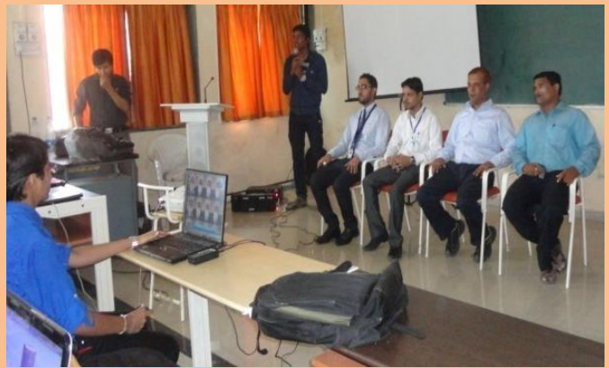
Robotryst Event Conducted by IIT Delhi