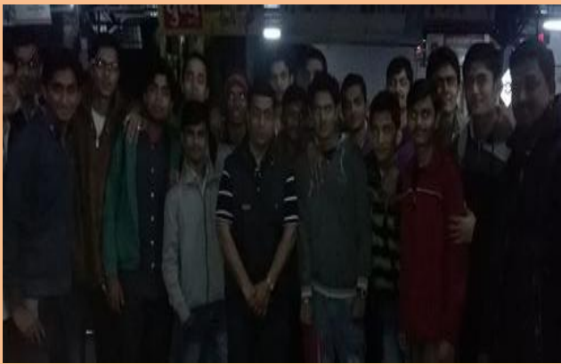
Industrial Visit at Universal Construction Equipments Ltd, Pune