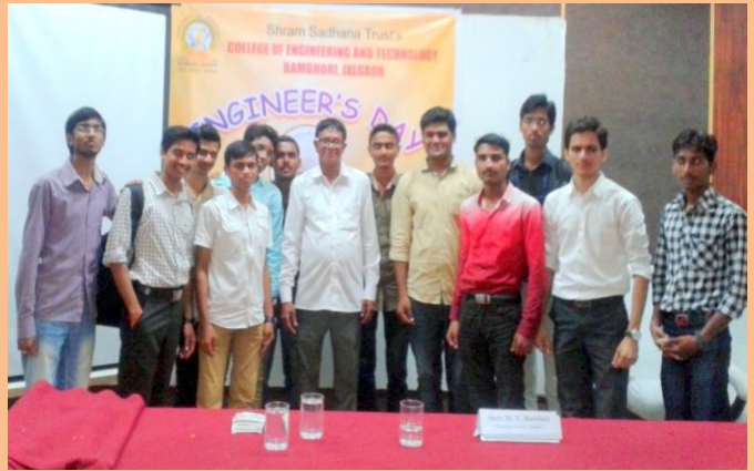
Engineers Day Celebration 2014